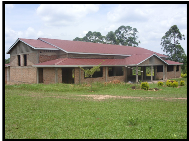
'GILEAD HALL' September 2011