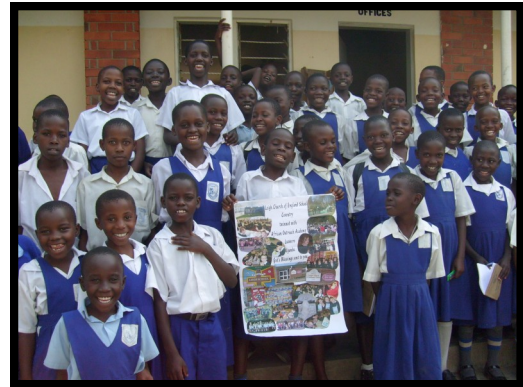
Children from the 'African Outreach Academy' in Luwero, Uganda hold up a poster from Leigh C of E School in Coventry UK.

Until the early part of 2010 our website was sadly lacking in many ways, not least of all the lack of relevant and up to date information, it was also difficult to access and impossible to alter. We owe a debt of thanks to our friend Charlie Reid, who has spent much time and effort in order to produce a site which is both easy to navigate and to keep updated, so please take a look and see what you think.